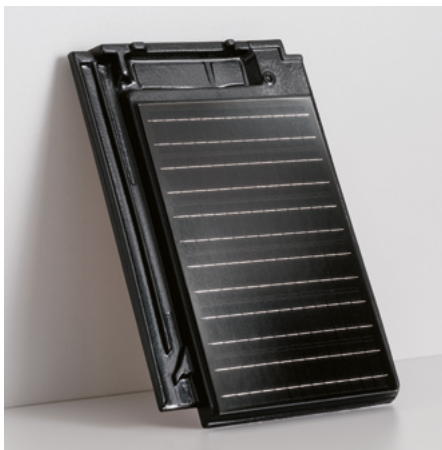
TJWST 1000 edelspacegrau fine engobe